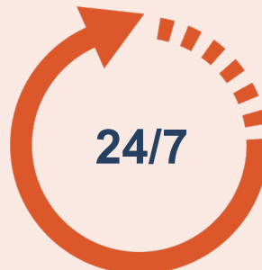
Global Command Center