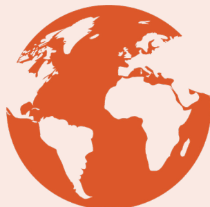
IOR/EOR Services in 110+ Countries