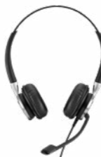
IMPACT 600 Series