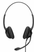
IMPACT 200 Series