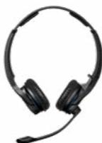
IMPACT MB Pro Series