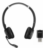
IMPACT 5000 Series