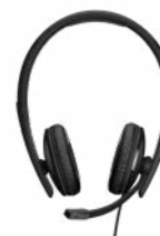
ADAPT 100 Series