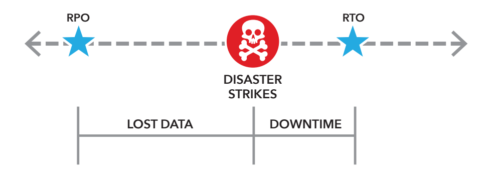
Figure 6: The difference between RPO and RTO

By calculating your desired RTO, you have determined the maximum time that you can be without your data before your business gets into serious trouble. Alternatively, by specifying the RPO, you know how often you need to perform backups, because you know how much data you can afford to lose without damaging your business. You may have an RTO of a day, and an RPO of an hour. Or your RTO might be measured in hours and your RPO in minutes. It's all up to you and what your business requires. But calculating these numbers will help you understand what type of data backup solution you need (See Figure 6).