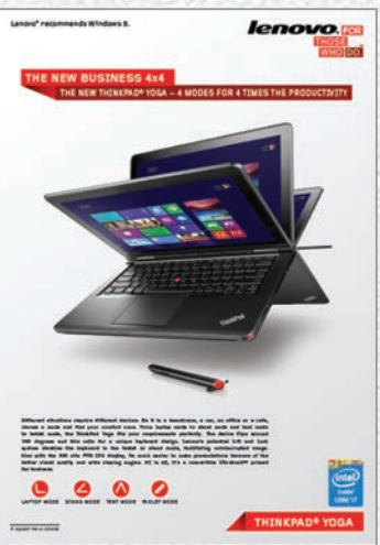
THINKPAD YOGA THE NEW MULTIMODE LAPTOP THAT TAKES CARE OF BUSINESS.